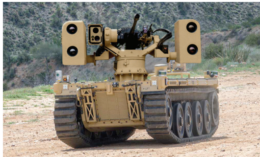
Robotic Platform Integration

Due to the R600MC's low weight and high lethality, this RWS can be mounted on medium wheeled or tracked platforms, greatly complementing a mechanized or high-mobility unit's overall firepower and contributing to mission success.