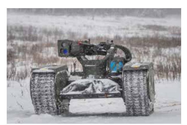
The R600S and the Milrem THeMIS

Like its lighter family members, the R600S is 'plug-and-play' compatible and is easily integrated with battle management systems.